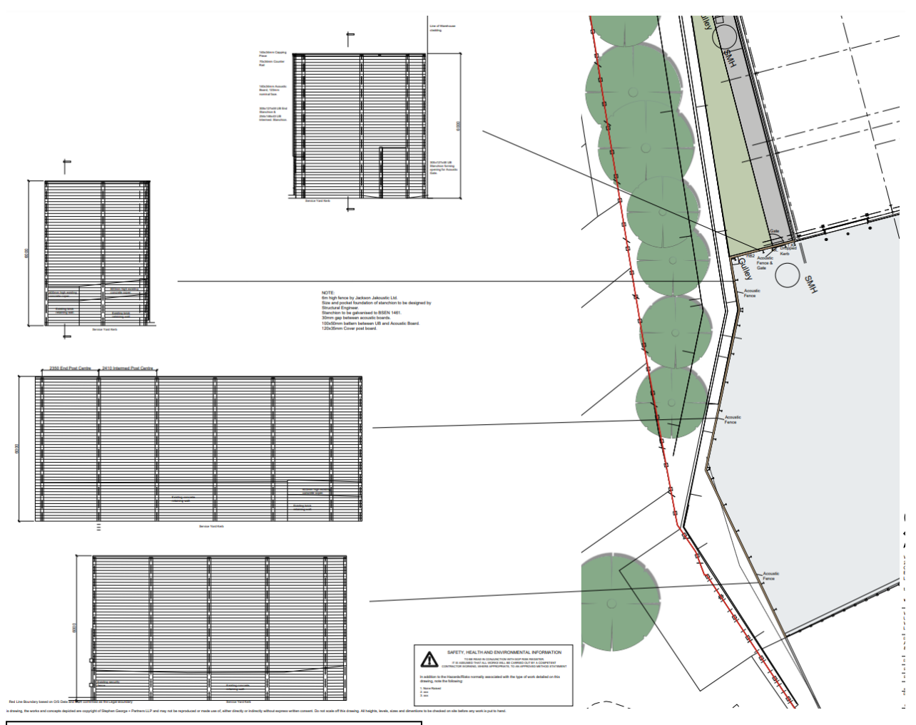
Acoustic Fencing – Elevations & Plan